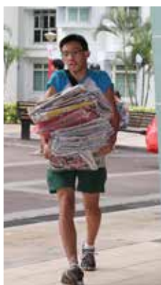
Hillgrove Sec. Sch student collecting old newspapers