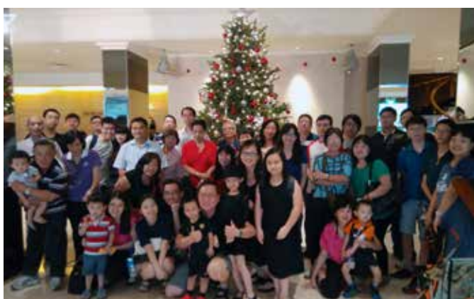
30th Anniversary at Miramar Hotel.