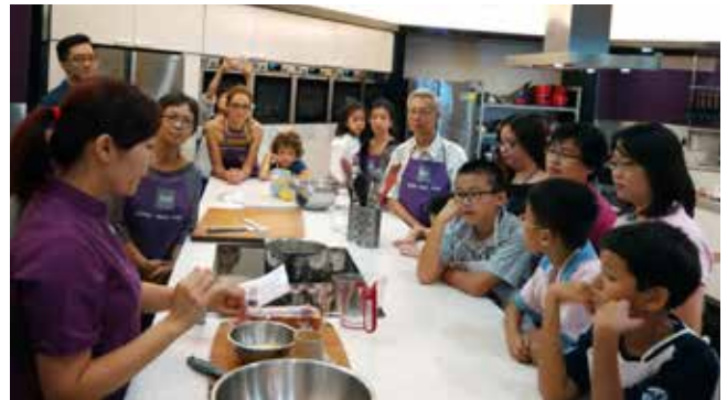
Mother's Day at Tott@Dunearn with Instructor and students

For nine members and their mothers, a married member and his wife whose devotion he appreciated – it was a Mother's Day with a difference! They paired up together to bake yummy cupcakes and cookies at Tott@Dunearn. It was indeed a 'sweet' event for all.