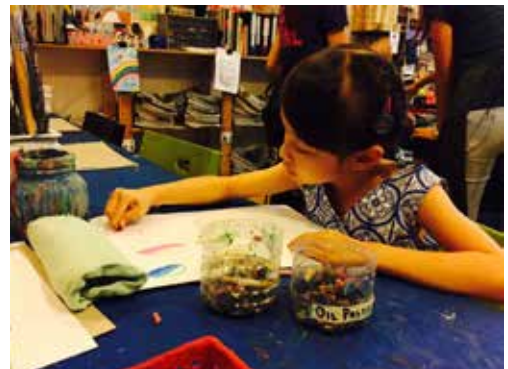
“Little Artist at work”