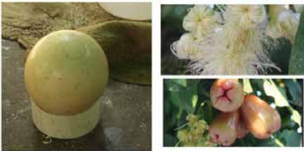
Ostrich Farm & Fruit Farm

On 12 December, 2015, to celebrate the Society's 30th Anniversary, members had a scrumptious buffet lunch at Ferntree Café in Miramar Hotel. Food and fellowship made the event memorable!