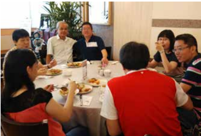
HSS 30th Anniversary Lunch

On 12 December, 2015, to celebrate the Society's 30th Anniversary, members had a scrumptious buffet lunch at Ferntree Café in Miramar Hotel. Food and fellowship made the event memorable!