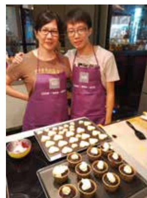
Mother & Son @ Mother's Day celebration for a baking session

At the community level, the Society was invited by Woh Hup Trust and Rotary Club, Bugis to share about the work of the Society. That provided the Society with an opportunity to create awareness of the haemophilia cause which is often unknown to many. "Together in One Voice" was another event to promote 'Rare Diseases Day' on