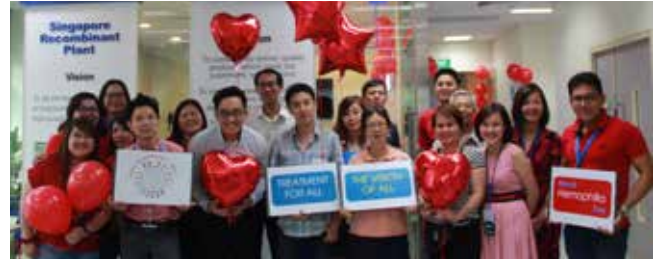
HSS members & staff of Baxalta's Bioscience Plant

On 22 April, 2016, in conjunction with World Haemophilia Day, some members of the Society toured the Baxalta Bioscience Plant in Woodlands. The activity benefitted both the members who had a chance to visit the Plant and the Plant staff who learnt more about haemophilia.